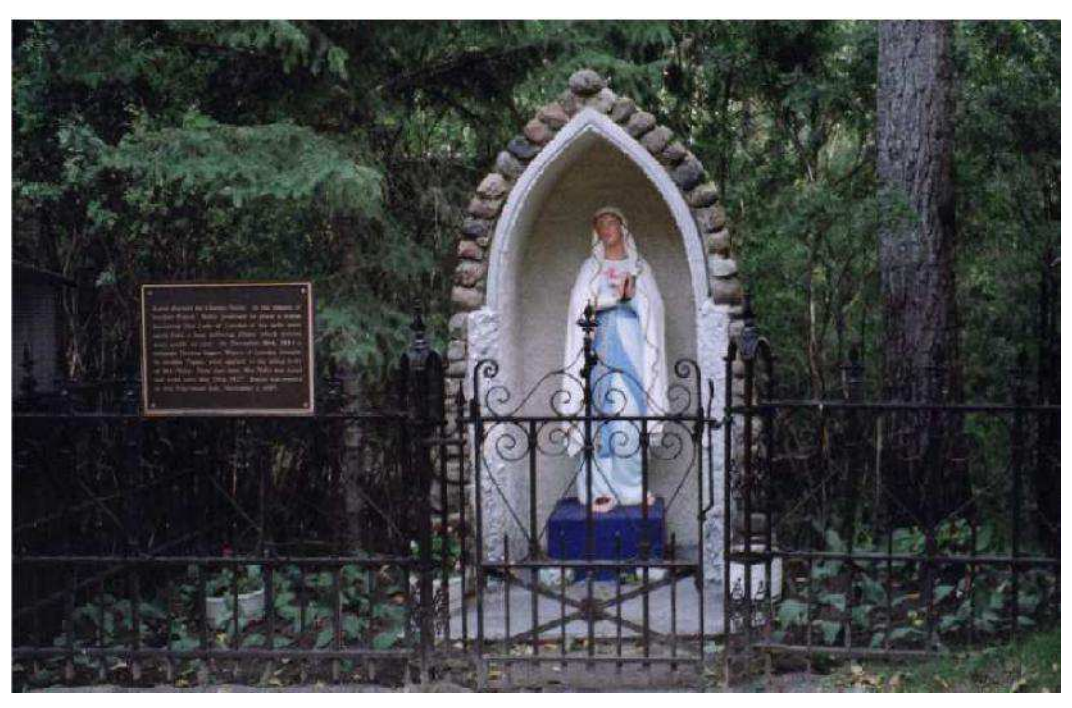
\label{eq:modern} Modern~day:~Our~Lady~of~Lourdes~St.~Laurent~Shrine In 2012, the 133^{\rm rd} annual pilgrimage took place on July 15-16.